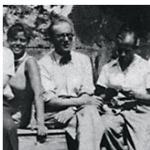
Le Corbusier, Pierre Jeanneret, Charlotte Perriand

In 1922, Le Corbusier began working in the new rue de Sèvres, Paris, atelier with his cousin Pierre Jeanneret with whom he shared research projects and design criteria in a profound and life-long professional relationship.